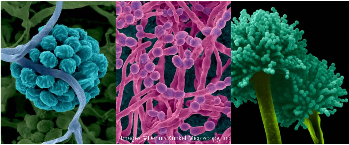
Microscopic photos of toxic molds. Left—Toxic mold ( Stachybotrys spp. ) Center—Mold hyphae and spores ( Cladosporium spp. ) Right—Black mold ( Aspergillus versicolor )